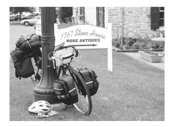
CABO PO Box 2684 Dublin CA 94568

http://www.rogergravel.com/wsl/vh_for_a.html.