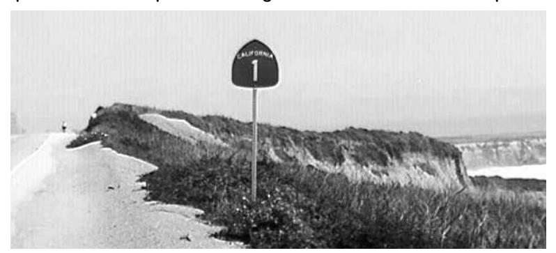
California Association of Bicycling Organizations

The Delta of the Sacramento and San Joaquin Rivers is a mosaic of sloughs and islands. Many waterfowl inhabit the area which is also popular with fishermen, boaters and waterskiers. Farming is the predominant occupation. The region retains an old-time atmosphere